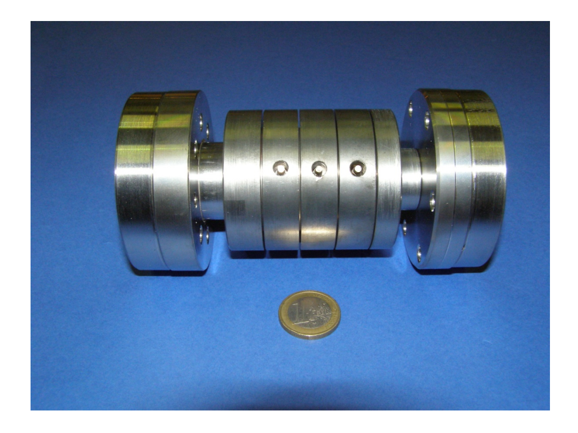
Fig. 8 The assembled molybdenum structure.