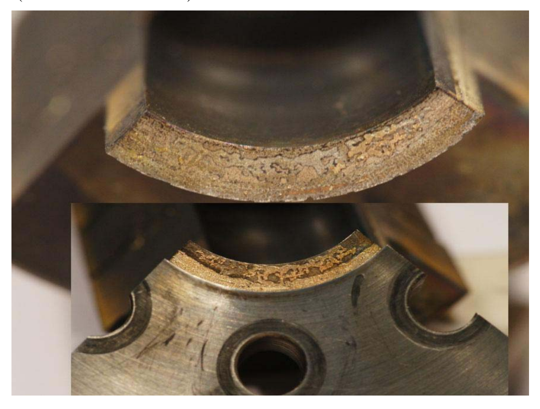
Fig 3 Highlight of joint failed in the right side of figure 2.