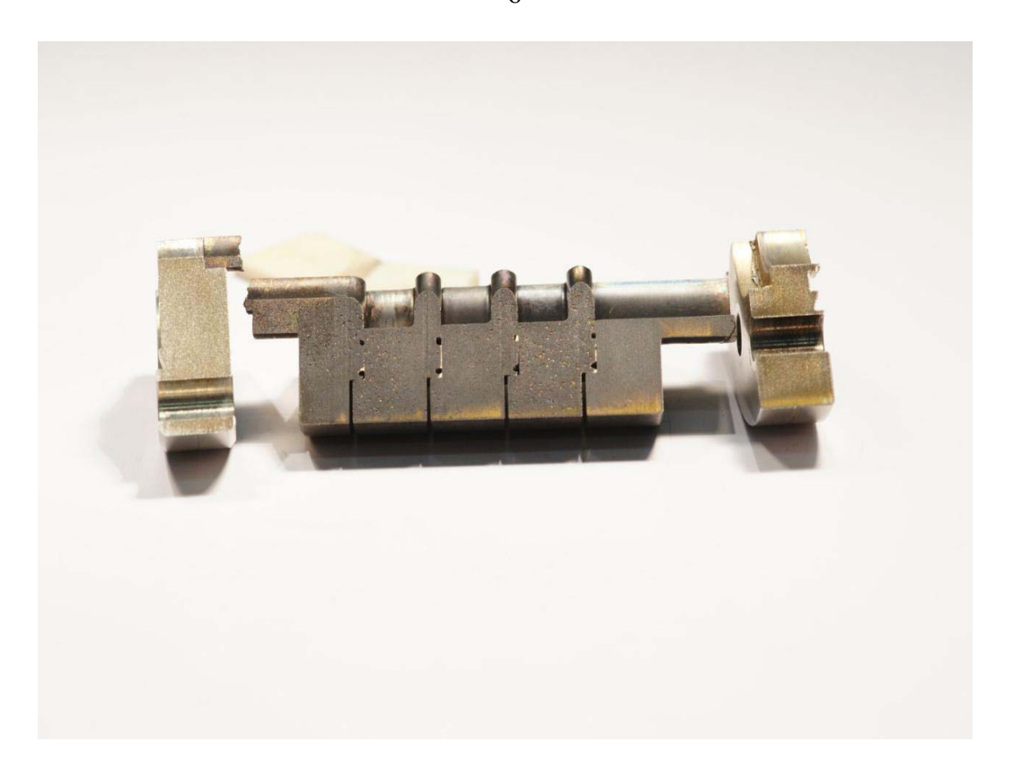
Fig 2 When one of the sections was cut again (also by EDM) both flanges on one of the pieces (a 1/4 section of the whole) detached as shown