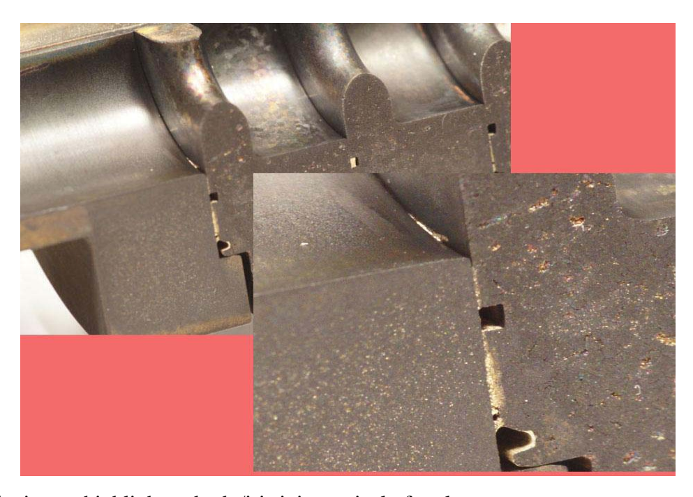
Fig.6 The image highlights a body/iris joint typical of moly structure.