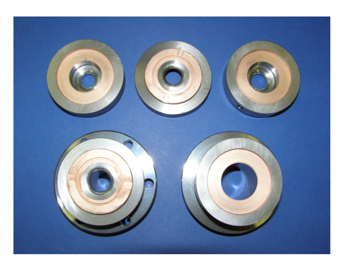
Fig 7 Components of moly structure, three cells plus connections to the end CF flanges