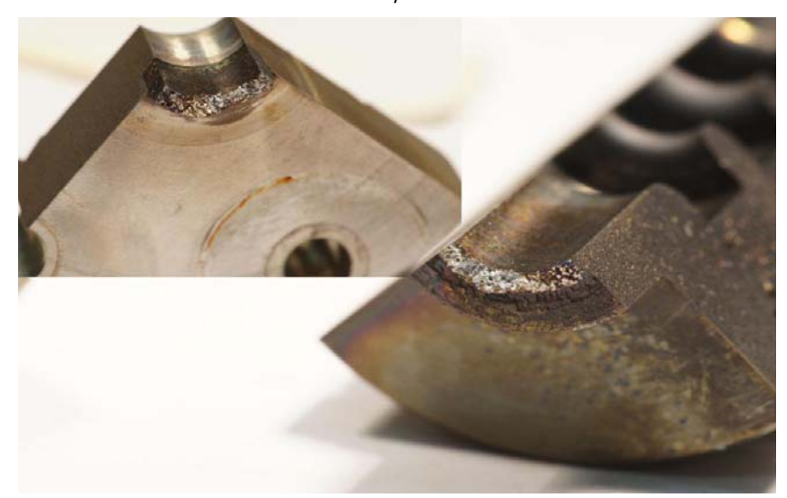
Fig 4 Highlight of molybdenum "extension tubes" failed adjacent to the SST flange in the left side of figure 2.