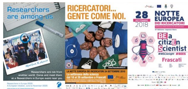
Figure 2: Evolution of the Researchers’ night posters: (left) 2005 - Researchers are among us; (center) 2010 - Researchers are people like us; (right) 2018 - Be a Citizen Scientist

It’s interesting to notice how in the mean time the way to communicate completely changed since 2006 (see Fig.2): from large, expensive, posters on public transport broadcasting the image of researchers’ faces to a logo that should represents a community where everyone finds their role. A science of everybody and for everyone.