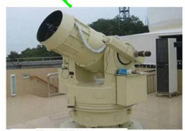
60cm SLR telescope