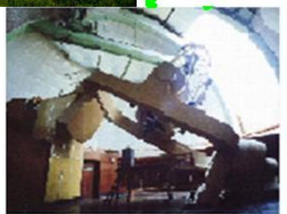
1.56 m Optical telescope

1.56m telescope receiving laser echo signal from satellites