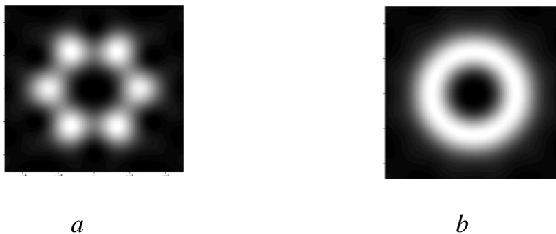
Fig.1 Far field diffraction patterns (FFDP) of reflected light from a single CCR with interference coating (a) and from retroreflector array (b)

Another way of creating a ring-like pattern, developed in RPC PSI, is to cover sides of a CCR with special interference coating [1] which provides a zero shift of phase of orthogonal components of electric vector in reflection from each side of a CCR (fig. 1). In this case, a ring with optimal angular radius and maximum intensity is formed, allowing to increase an effective reflective area by about 50%.